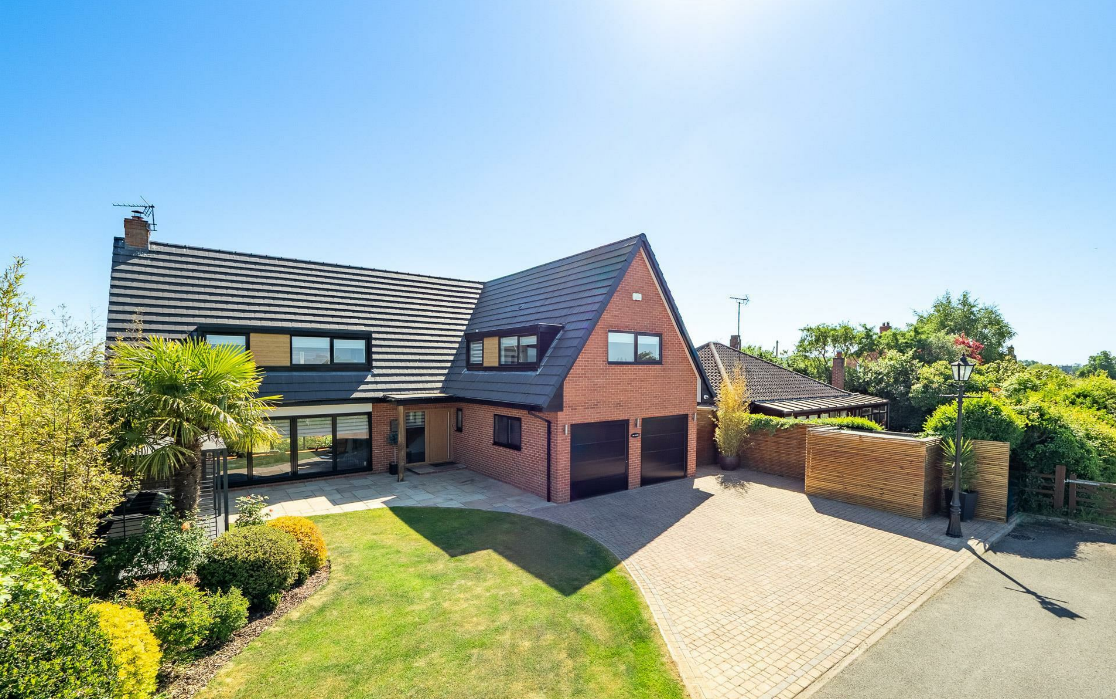
School Hill, Wootton Wawen Henley-in-Arden, B95 6BT